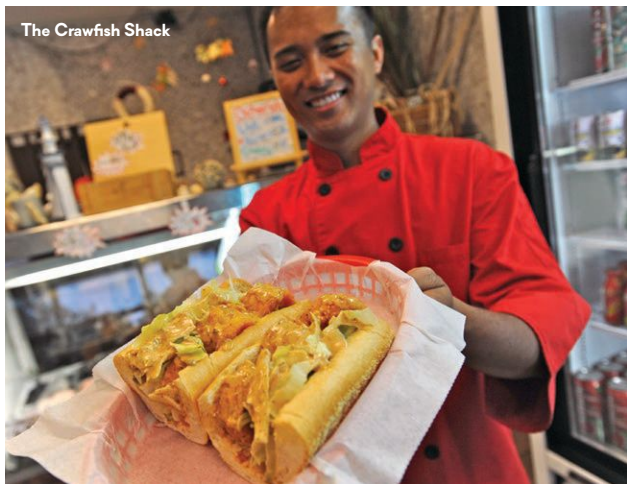
The Crawfish Shack