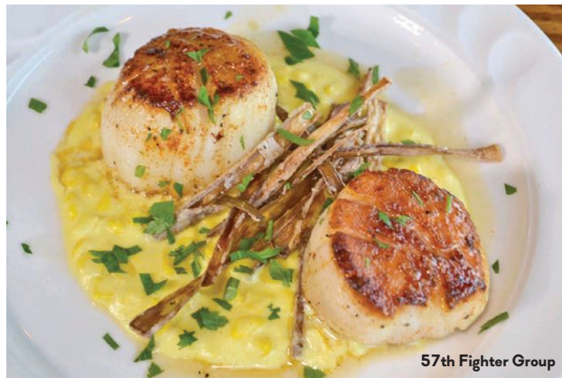
57th Fighter Group